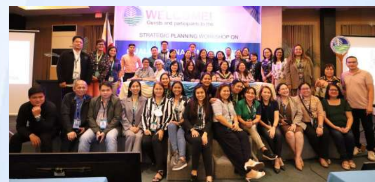
The DENR 10 hosts the Strategic Planning Workshop on Quality Management System Implementation and Continual Improvement in all DENR Offices on July 26-28, 2023 in Cagayan de Oro City.

The Strategic Planning Workshop on QMS was intended to strengthen the implementation of ISO 9001:2015 Quality Management System for all DENR Offices and intensify implementation of Risks, Opportunities Analysis and Actions Planning (ROAAP). The activity was participated in by Central Office QMS Team, representatives from the Central Offices Services, Client Satisfaction Survey Team and Stakeholders Feedback Team, and Quality Management representatives and Audit Team representatives from Regions and Staff Bureaus.