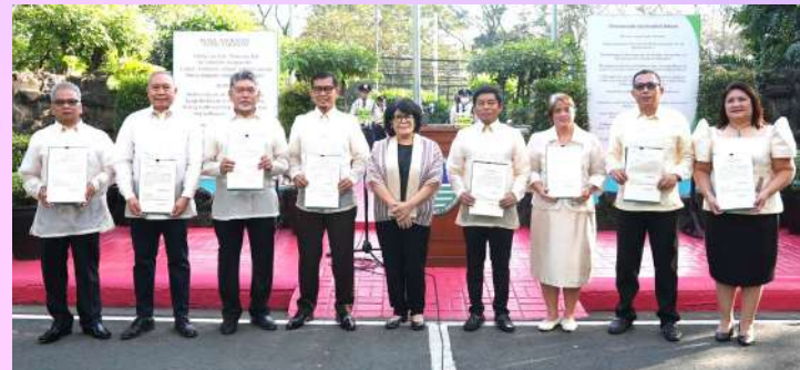
DENR Secretary Maria Antonia Yulo-Loyzaga (center) joins with newly appointed and promoted field officials from different regional offices during the Monday Convocation at the DENR Central Office.