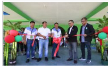
TURN-OVER OF CENRO TALAKAG MAIN OFFICE BUILDING AND RECORDS, PROPERTY ROOM