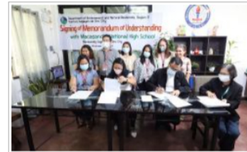
TAYO ANG KALIKASAN CAMPAIGN WITH MNHS