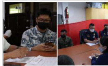
RAILTF 4TH QUARTER MEETING