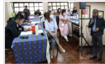
CAPACITY BUILDING FOR REGIONAL BIDS AND AWARDS COMMITTEE